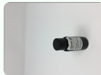
The photos on this report are of a sample collected by the lab and may vary from the final packaging.